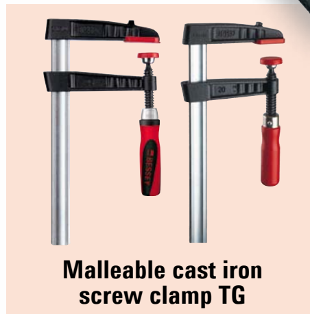
Malleable cast iron screw clamp TG