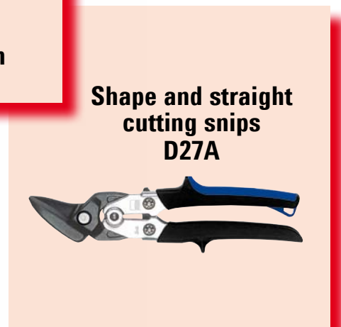
Shape and straight cutting snips D27A