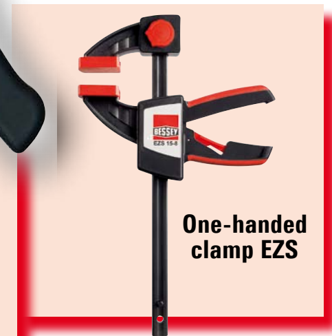
One-handed clamp EZS